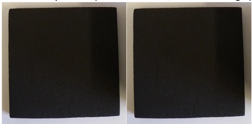
Figure 1: Representative specimen (front face on left, back face on right)

Figure 1 illustrates a representative specimen of that tested.