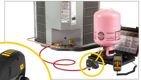
Manual or Automatic CHARGING

Pair The CC220EW To The CPS Wireless Solenoid Valve (SVW) Accessory For: