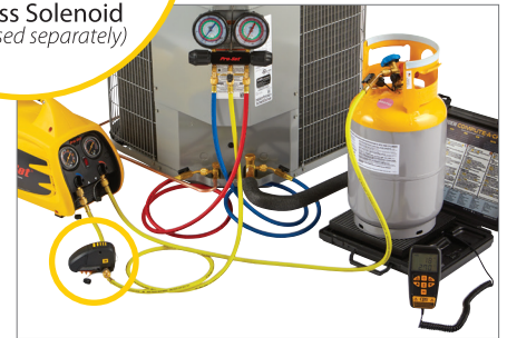
Manual or Automatic RECOVERY

SVW Wireless Solenoid (Purchased separately)