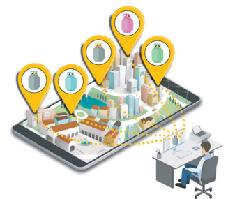
Geotag Tank Location