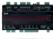
AK-CC 550 features energy optimisation of the complete case and predefined application types for quick adaptation to different cases or cold room setups.

patented minimum stable superheat (MSS) algorithm ensure your customers' low energy consumption and sustainable savings. Our intelligent defrost control enables the highest possible level of food quality with a minimum of energy consumption, and due to advanced energy balance calculation, defrost is initiated only when energy consumption starts rising.