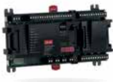
AK-CC 750 controls up to 4 evaporators in a case line-up or a room. The fully flexible in- and output definition makes it adaptable to almost any application.